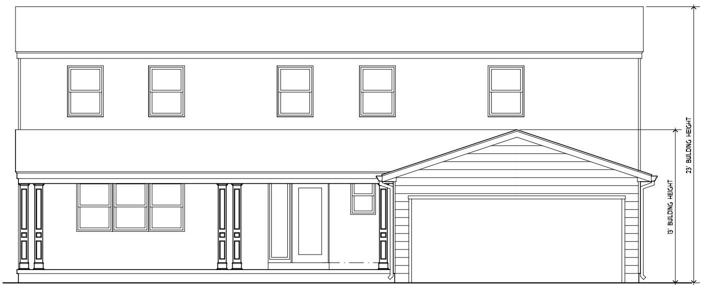
3 AI PROPOSED FRONT ELEVATION SCALE: 1/4" = 1'-0" (24"X36" SHEET) SCALE: 1/8" = 1'-0" (11"X17" SHEET)